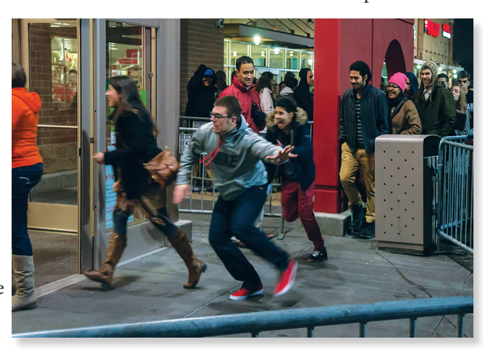
People will race to get the "latest and best" gadget, with no sense that they are entrenched in sociocentric ideologies, sometimes even trampling others in the process.

when we enter life as humans, most of which are created by humans functioning within the twin logics of group control and group conformity. The critical thinker examines not the many thousands of mores and rules in a given culture, but the fundamental beliefs and assumptions upon which they are based.