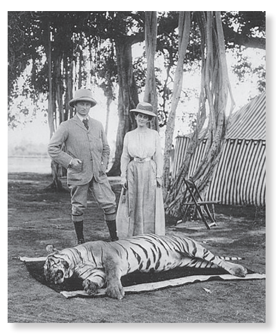
Tigers have been exploited for human use and "sport" for hundreds of years or more.

Tigers are all but extinct in the wild. ... There's a valuable black market for tigers. Tibetans wear tiger-skin robes; wealthy collectors display their heads; exotic restaurants sell their meat; their penis is said to be an aphrodisiac; and Chinese covet their bones for health cures, including tiger-bone wine, the "chicken soup" of Chinese medicine. ... In some Asian countries, tourist attractions called tiger parks secretly operate as front operations for tiger farming—butchering captive tigers for their parts and offering a potential market for wild-tiger poachers too. (p. 98)