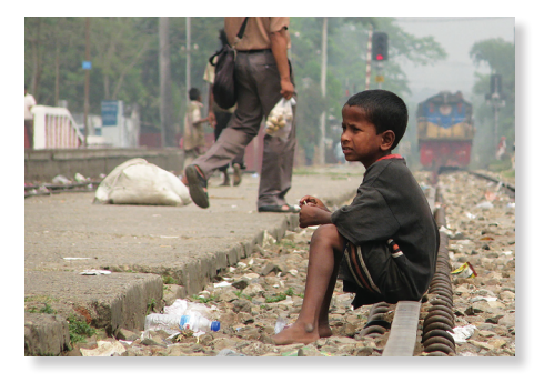
Street child, Bangladesh.

is the best economic system; those who argue for public ownership and cooperative management of the means of production, through what are frequently stereotyped as "socialist" programs, are often marginalized and even demonized. People in capitalist countries generally fail to see capitalism as one choice among several viable economic systems. Born into capitalistic societies, they tend to uncritically accept capitalistic ideology.