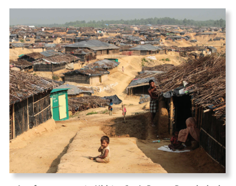
A refugee camp in Ukhia, Cox's Bazar, Bangladesh, is inhabited by Rohingya refugees that fled from ethnic and religious persecution in neighboring Myanmar. It is estimated that more than 24,000 Rohingya were killed by the Myanmar military and local Buddhists since "clearance operations" started in 2017. Ethnic wars directly result from dangerous group ideologies.

... 160,000 dead by mid 1963; 700,000 tortured and maimed; 400,000 imprisoned ; 31,000 raped ; 3,000 disemboweled with livers cut out while alive; 4,000 burned alive; 1,000 temples destroyed; 46 villages attacked with poisonous chemicals; 16,000 [concentration] camps existing or under construction. (p. 59)